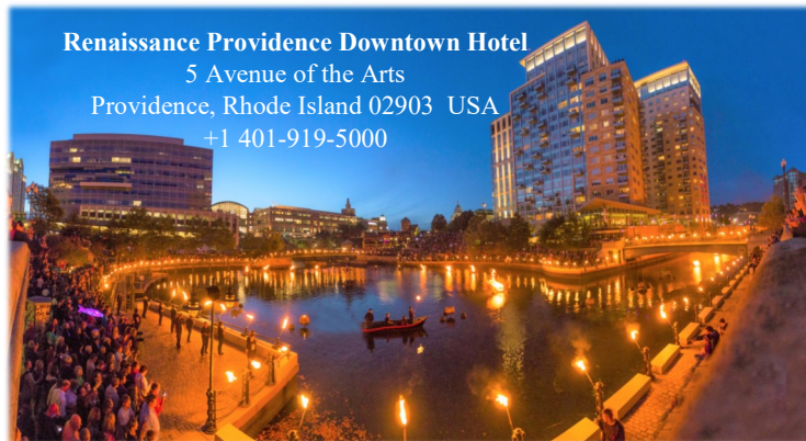
Renaissance Providence Downtown Hotel 5 Avenue of the Arts Providence, Rhode Island 02903 USA +1 401-919-5000

Housed in a historic 1920's era building, the Renaissance Providence Downtown Hotel provides the perfect blend of modern luxury and comfort in a relaxing downtown hotel. This 4-star hotel offers a convenient location within close proximity to Providence Place Mall, Riverwalk & Waterplace Park, Brown University, Providence College and the Providence Performing Art Center or for visiting the beautiful state of Rhode Island.